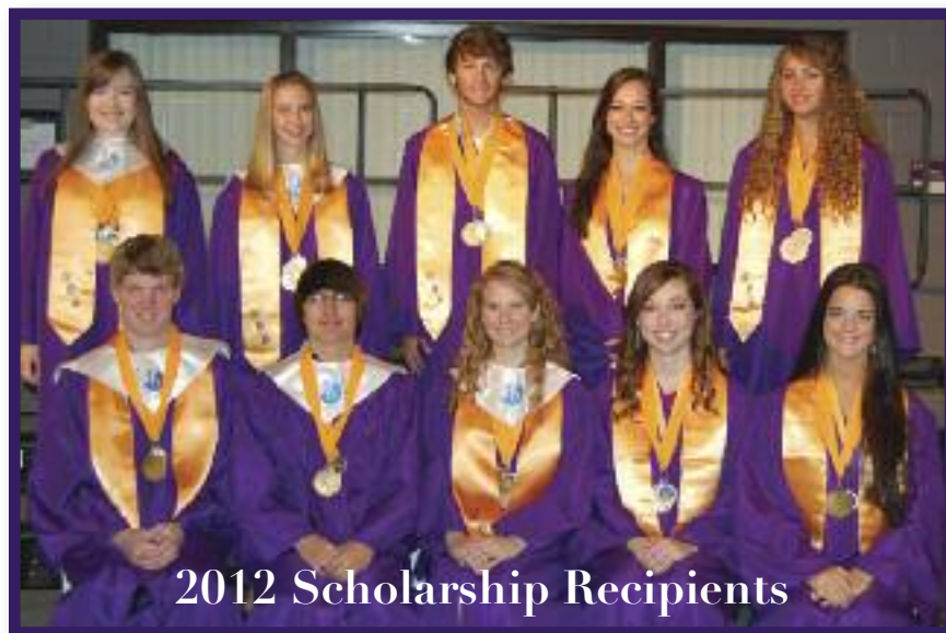
2012 Scholarship Recipients

The Camdenton R-III School District Education Foundation scholarships were started with the Class of 2004. From 2004 through 2012, 65 scholarships have been awarded. Students awarded this $1,000 scholarship are selected from the top twenty students of their graduating class.