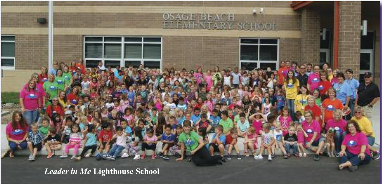
Leader in Me Lighthouse School