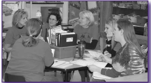
Dogwood Elementary teachers during early release collaboration