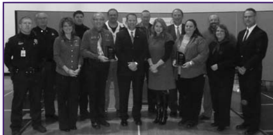
FBI Visits Oak Ridge Intermediate Details on Page 3.

PRSR STD U.S. POSTAGE PAID CAMDENTON, MO 65020 PERMIT # 95222