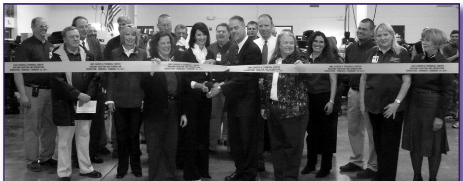
LCTC Ribbon Cutting Ceremony, February 24, 2011